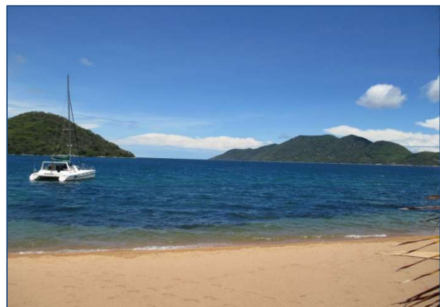
Southern end of Lake Malawi