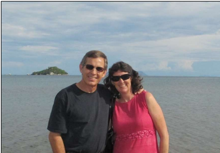
Lake Malawi 2013

After our meetings were finished, Thursday night through Sunday night, we witnessed between 400-500 people receiving Christ Jesus! Others experienced physical healings, along with those who were delivered from demonic oppression and possession. God's kingdom came into the lives of many! He alone is glorified for HE ALONE IS GOD! Only He is good and loves us with infinite love! Pursue Him, put your trust in Him and be filled with the Spirit of life!