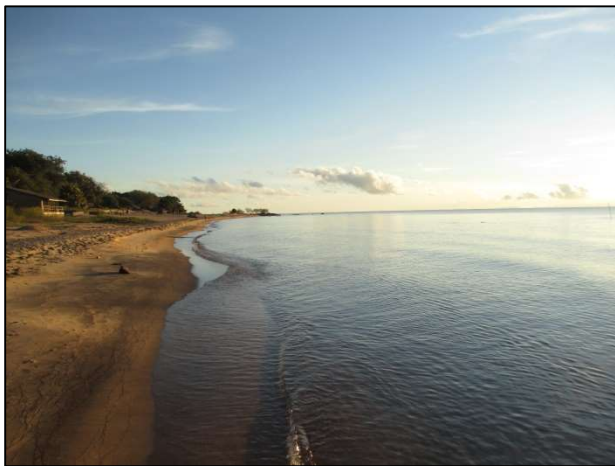
Sunrise over Lake Malawi, Nkhota Bay